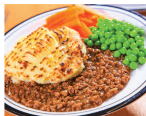
Cottage Pie served with Seasonal Vegetables