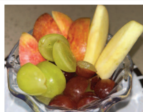
Apple & Grape Pot