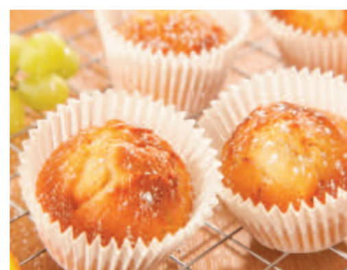
Apple & Cinnamon Muffin