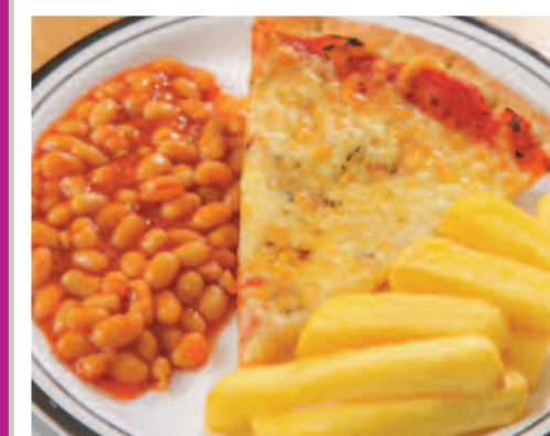
Cheese & Tomato Pizza served with Chips & Peas or Baked Beans