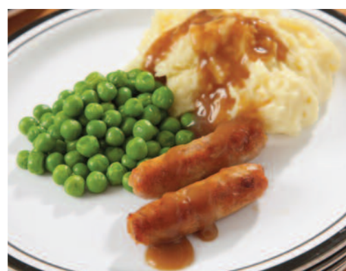
Sausages served with Mashed Potato, Seasonal Vegetables & Gravy