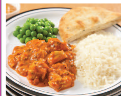
Chicken Tikka Masala served with Rice, Naan Bread & Seasonal Vegetables