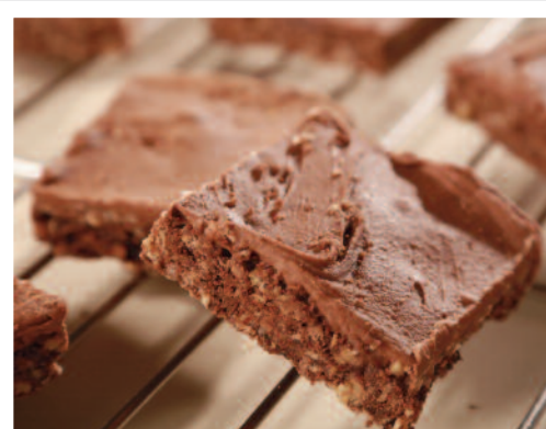
Iced Chocolate Oaty Square