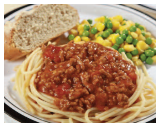
Spaghetti Bolognese served with Garlic & Herb Bread and Seasonal Vegetables