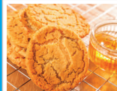
Golden Crunch Cookie

AVAILABLE EVERY DAY – UNLIMITED SALAD, FRESHLY BAKED BREAD, FRUIT YOGHURT & FRESH FRUIT PLATTER. FOR ALLERGEN INFORMATION, PLEASE ASK ONE OF OUR CATERING TEAM. ALL THE ABOVE DISHES ARE SUBJECT TO AVAILABILITY.