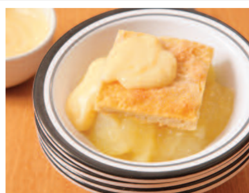
Apple Pie & Custard