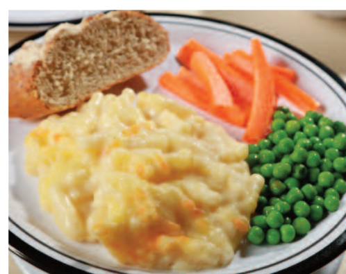
Mac 'n' Cheese served with Garlic & Herb Bread and Seasonal Vegetables