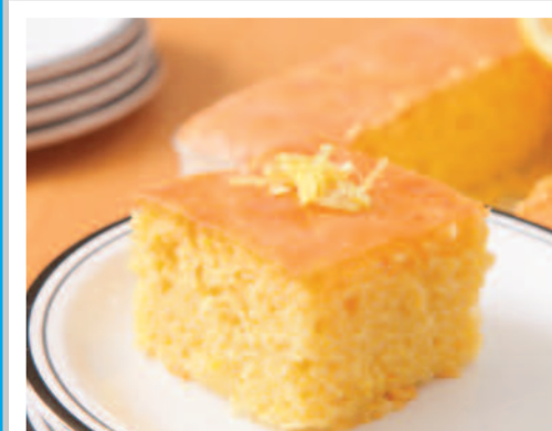
Lemon Drizzle Cake