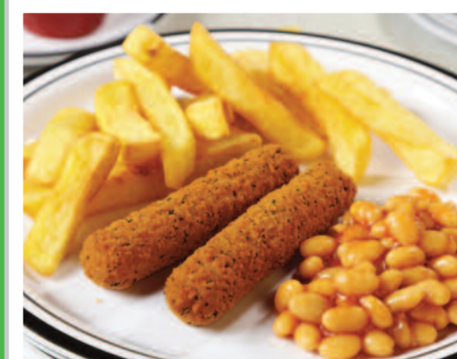
Breaded Mozzarella Sticks served with Chips & Peas or Baked Beans