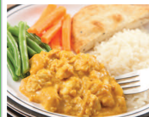
Chicken Korma served with Rice, Naan Bread & Seasonal Vegetables