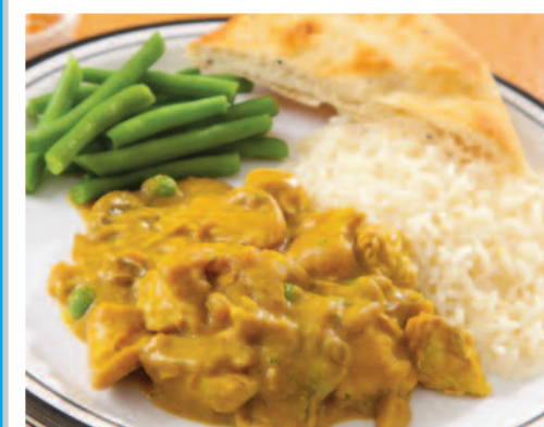
Chinese Chicken Curry served with Rice, Naan Bread & Seasonal Vegetables