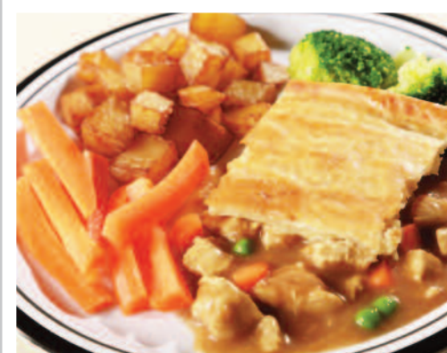
Homemade Chicken Pie served with Diced Crispy Potatoes & Seasonal Vegetables