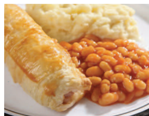
Homemade Sausage Roll served with Mashed Potato & Baked Beans