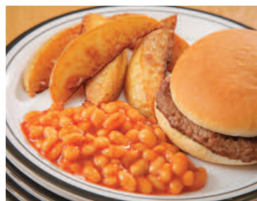
Beef Burger served in a Bun with Potato Wedges & Seasonal Vegetables or Baked Beans