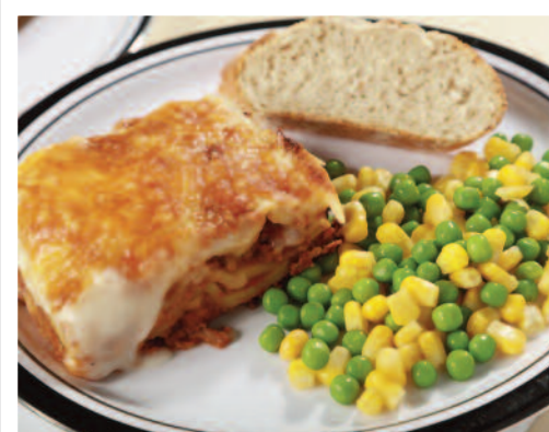
Beef Lasagne served with Garlic & Herb Bread and Seasonal Vegetables