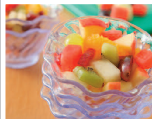
Fresh Fruit Salad